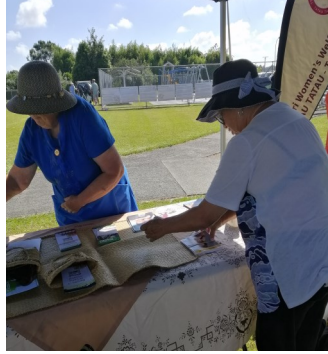
Putting up the Māori Women's Welfare League tent

Free sausage sizzle was very popular keeping our volunteer team of Sue and Tony very busy giving away 300 sausages.